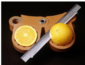
KNIFE HALVING FRUIT

The degree of juice extraction is determined by the amount of air pressure applied to the cups and by adjustable stops which limits the cups' clearance with the reamers. This feature provides positive control of reamer penetration and allows accommodation for peel thickness variations. Adjustments for extraction pressure can be made quickly, and while the extractor is in operation. The Brown family of citrus juice extractors can be equipped with a variety of cups and reamers to help meet customer's requirements. All Brown extractors are designed for easy and quick access to their internal juice contact surfaces and working parts for inspection to insure complete sanitation.