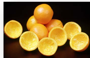
EXTRACTED PEEL HALVES