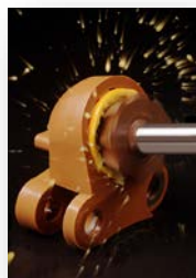
REAMER AND CUP