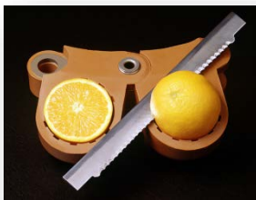
KNIFE HALVING FRUIT